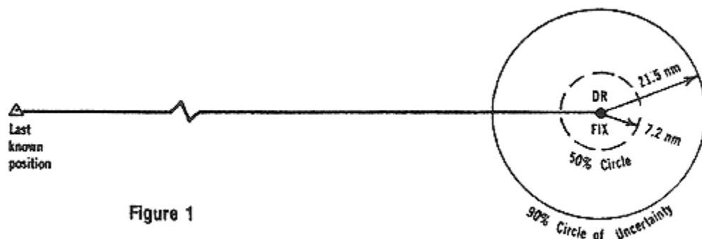
Figure 1, for example, shows where the pilot of a 150-knot aircraft has computed his position to be at the end of one hour. The radius of the circle of uncertainty is equal, therefore, to 20 nautical miles (nm) +1% of which equals 21.5 nm. In other words, there is a 90% probability that the pilot is actually within 21.5 nm of where he thinks he is.

A rule of thumb states that 90% of the time the maximum dead reckoning error (per hour of flight) is 20 miles plus 1% of the estimated distance flown during that hour.